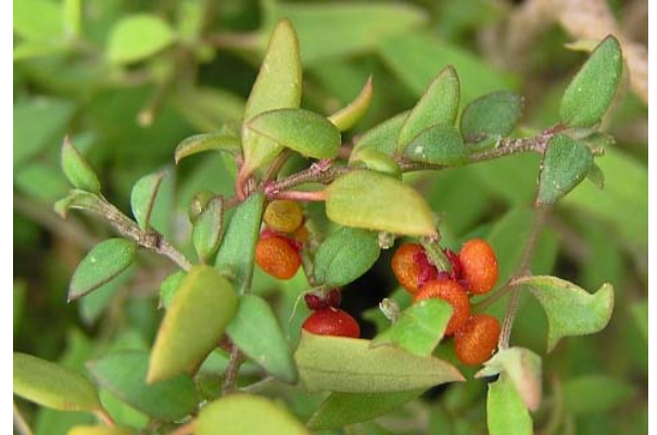
Edible berries on Nodding Saltbush during Summer and Autumn

These sweet berries are edible as bush tucker and provide food for birds. The leaves are also edible, although boiling is necessary to remove excess salt.