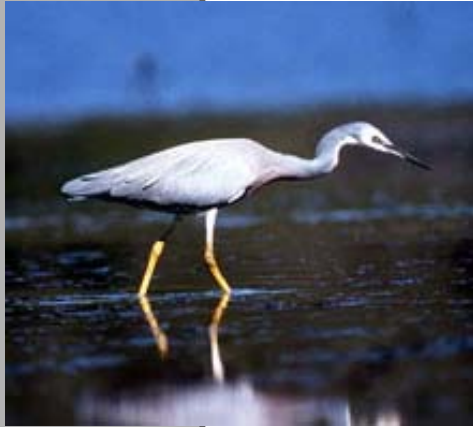
White-faced Heron wading in the shallows