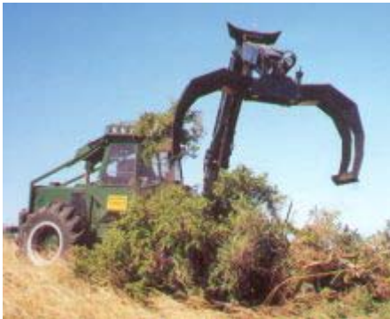
Mechanical removal of African Boxthorn

While the removal of woody weeds results in some short-term loss of habitat for native animals, according to Adam Shalekoff, Coordinator of Bushland Management at the City of Darebin, the use of a crane-like excavator & groomer is a safer, more cost-effective method than manual removal.