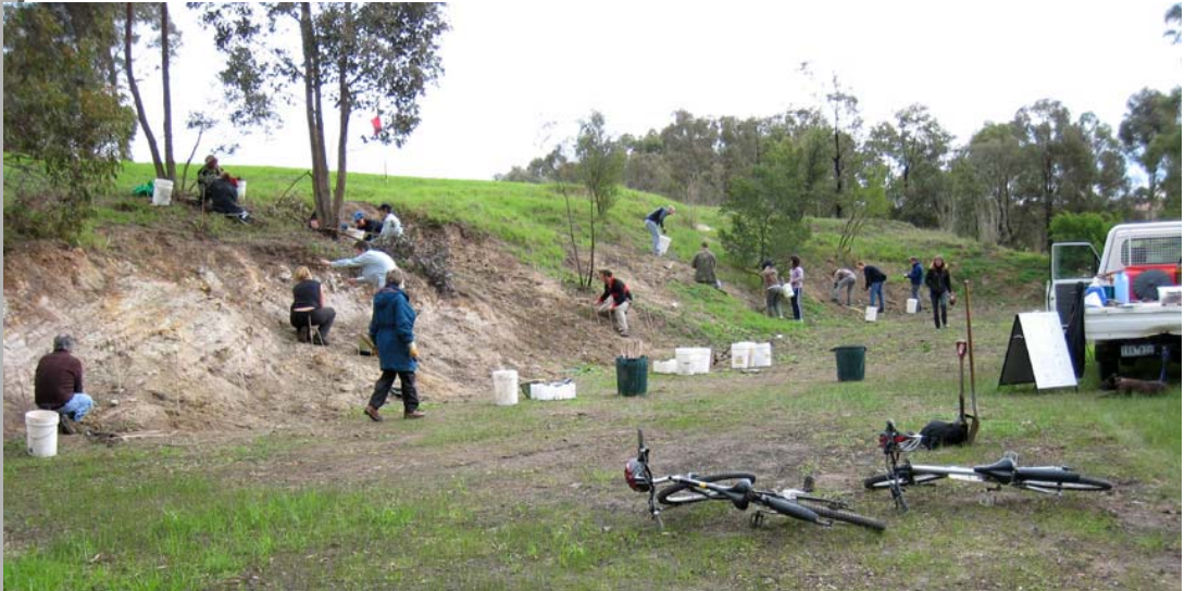
First FoEC planting Day was a huge success

“We are all now looking forward to watching the results of our work and planning more rewarding activities over the upcoming months.”