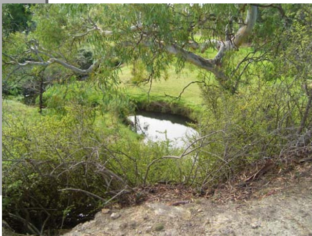
Remnant River-red Gum, North Coburg

Make sure you don't miss the launch the project on Sunday 22 July 2007.