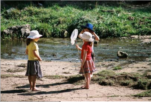
Young Water Watchers looking for bugs