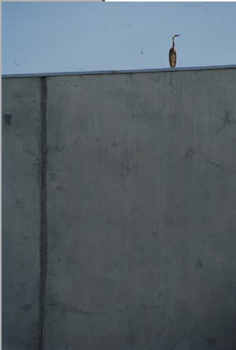
Lonely Heron perched on a factory wall near Mahoneys Road in Thomastown

“Was she lamenting the poor condition of creek in that part of its catchment?”