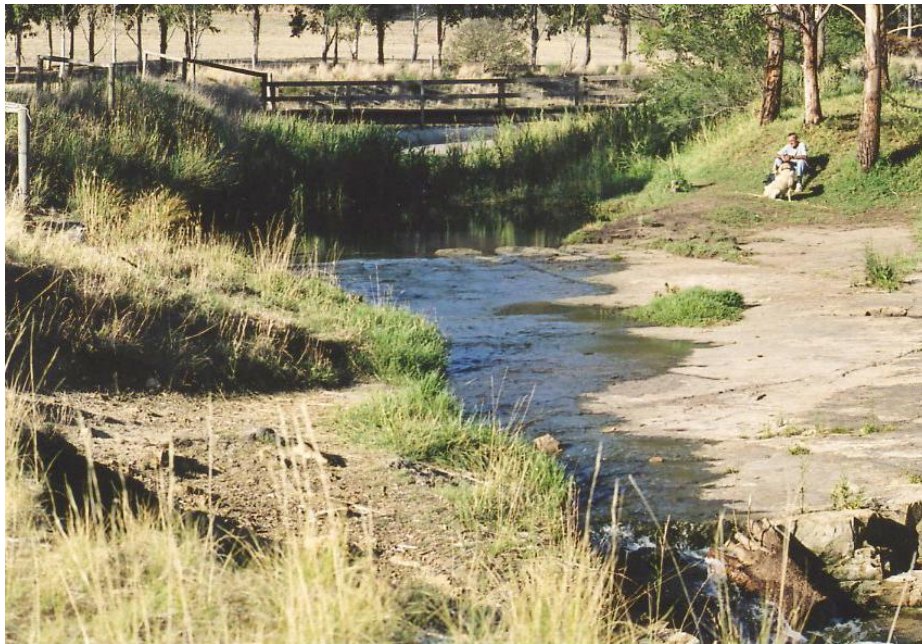
Edgars Creek Waterfall, North Coburg

Edgars Creek flows along a 17 km course from its headwaters in Wollert through the highly urbanised suburbs of Epping, Thomastown and Reservoir, finally joining the Merri Creek in North Coburg.